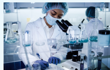
Hospital & Labs